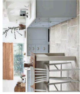
Each house comes with a Neptune kitchen

of shops that includes a café, a restaurant, a wine shop, a butcher's and a gallery. While the square is the place for people to congregate, individual properties are conceived to remain very private: 'Raithwaite has an incredible topography: it rolls down into a beck that's fed from a beautiful lake, which then backs up into