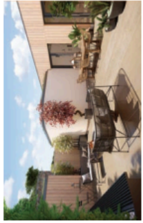
Villas have their own private courtyards

To create interiors in keeping with the Raithwaite vision, Maritime Capital have teamed up with Neptune. The design company has conceived three different looks—coast, beach and moor—which