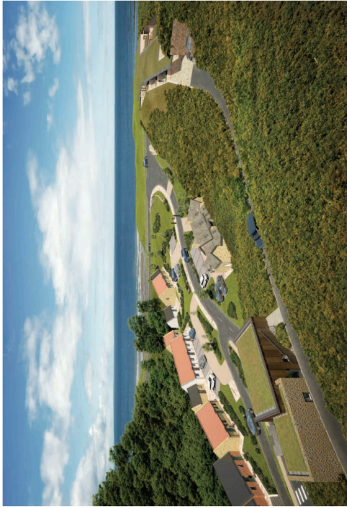
Designed with sustainability in mind, the new development at Raithwaite is perfect for families looking for eco-friendly second homes