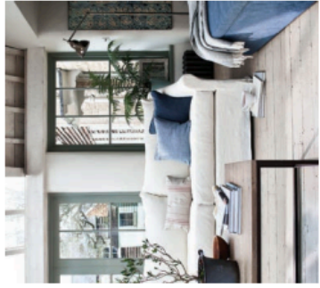
Buyers get an £10,000 Neptune voucher

draw on the colours of the local landscape. 'The coastal palette, for example, combines the blue tint of the pebbles found on the local beach with the grey-green dune grass and the butterscotch hues of the sand, whereas the moors scheme mixes the greens of the summer grasses with the purple tinge of heather and a bold pop reminiscent of flowering gorse.