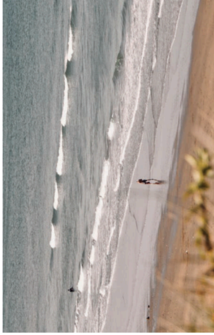
A surfing hotspot, the local beach is also a great place to relax and enjoy waterside

'As a bit of fun,' adds Mr Hunter, 'we are also giving every buyer a complimentary